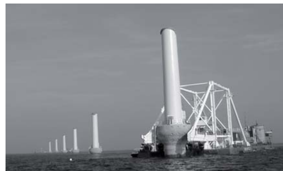
Figure 4: The floating crane with a foundation and the lower part of the tower at the site just before installation.

The floating of the gravity structure including the lower section of the tower worked out satisfactory. Careful estimation of low tide was necessary, as there at a time was only 10 to 20 cm between the concrete slab and the seabed. The work was carried out day and night depending of the weather forecast. The positioning in horizontal direction was far within the tolerances specified. The vertical inclination of the tower was better than the requested accuracy. The special measures to cope with too high deviations in inclination were not activated.