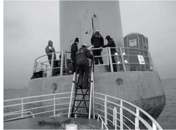
Figure 3: A safe access to the foundation is essential when the waves and current are moving the ship.

The compaction of the rock cushion was much more complicated and time consuming than expected by the contractor. Several sites needed injection after the placement of the foundation in order to secure sufficient contact to the compacted rock cushion.