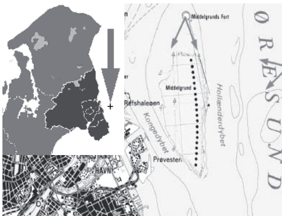
Figure 1: The location of the Middelgrunden Wind Farm east of Copenhagen harbor.