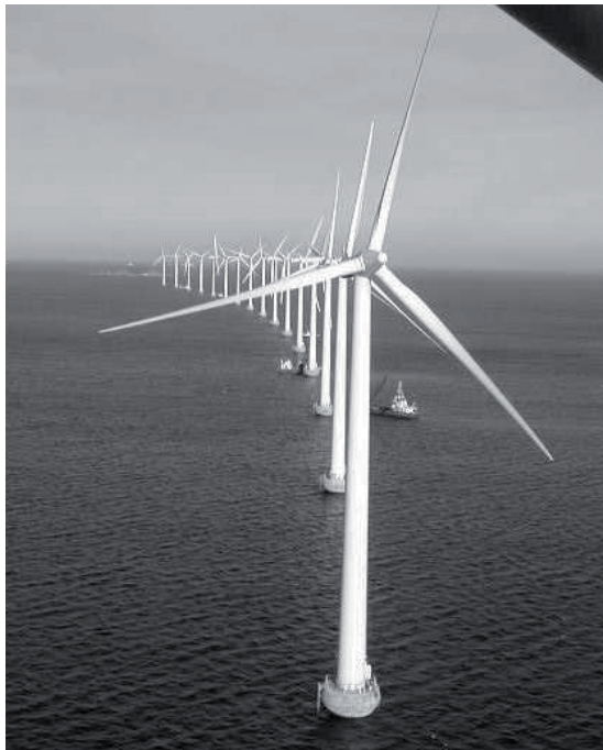
Figure 2: The Middelgrunden Wind Farm.

The use of a larger floating crane turned out to give opportunity to revise the way of the total installation in a positive way. The larger capacity allowed the lower tower section including switchgear, transformer and control equipment to be established in the dry dock. The lower section of the tower already placed on the foundation allowed thereafter an effective way of pulling up the submarine cables into the tower as soon as the foundation was placed on its final site.