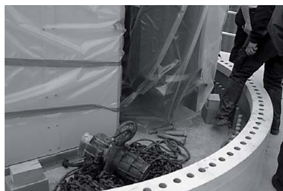
Figure 5: The switchgear and transformer on top of the concrete foundation ready for placement of the tower.

If the lower section of the tower had not been established in the dry dock, a much larger delay would have appeared.